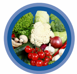
Pop Up Pantry 228 hours