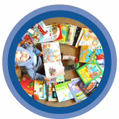
Imagination Library 40 hours