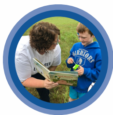
Board of Directors 302 hours